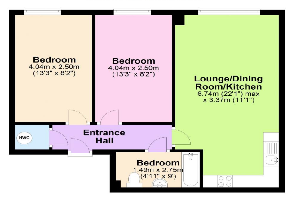
Total area: approx. 54.7 sq. metres (588.9 sq. feet)

Approx. 54.7 sq. metres (588.9 sq. feet)